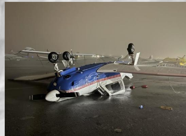
The tornado hit North Perry Airport and even flipped over planes