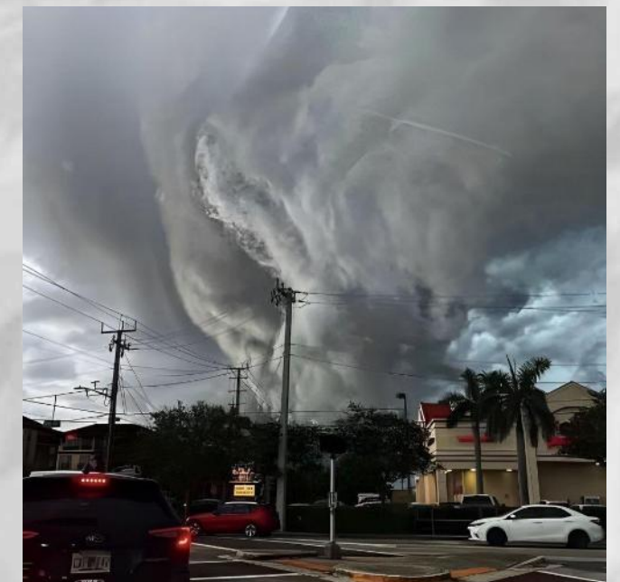
Hurricane Ian caused tornadoes in Broward County