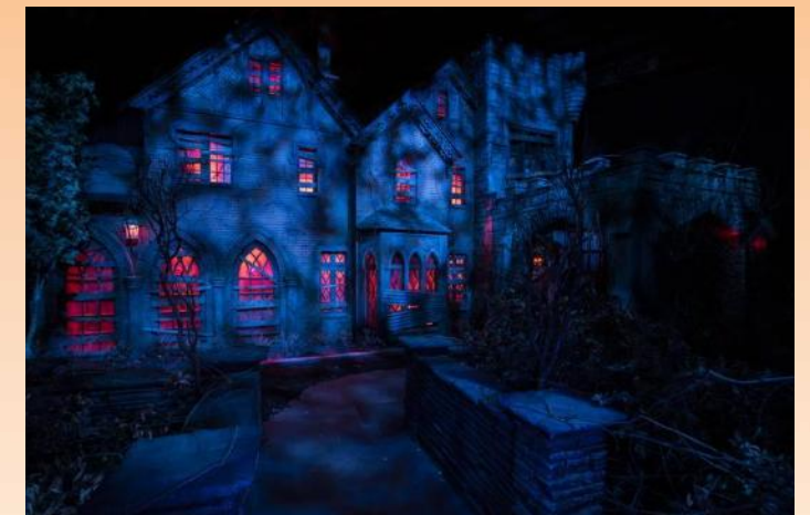
Halloween Horror Nights at Universal Orlando is known for immersive frights.