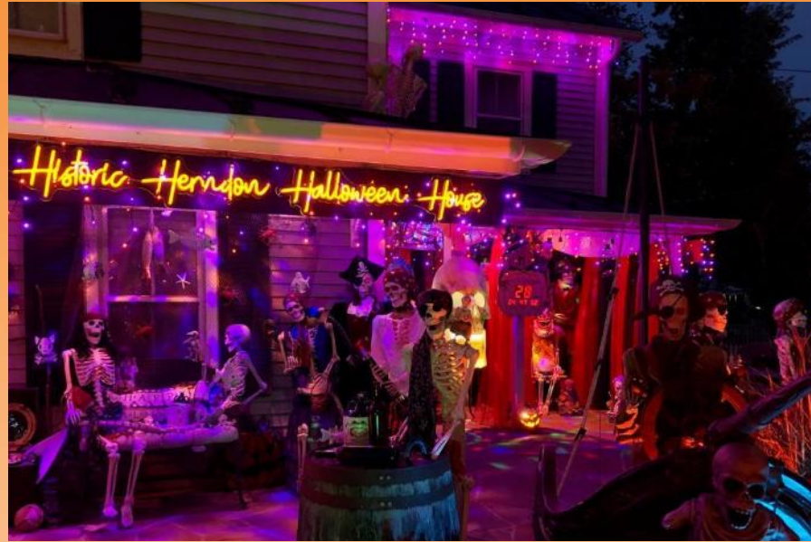
A Halloween haunted house that will leave you having nightmares.