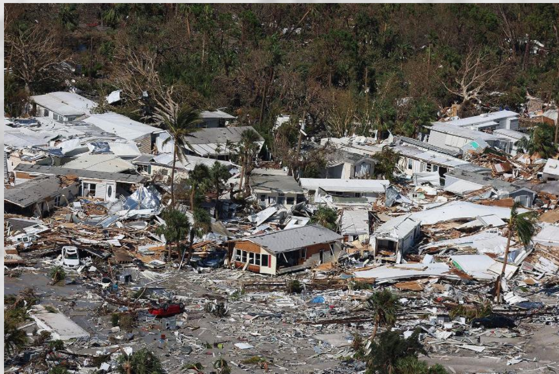
The damage that Hurricane Ian did was unforgettable in Fort Myers, Florida.