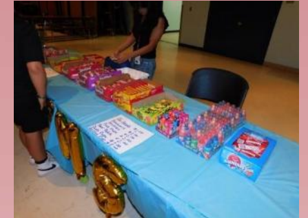
At the dance there was amazing candy being sold!