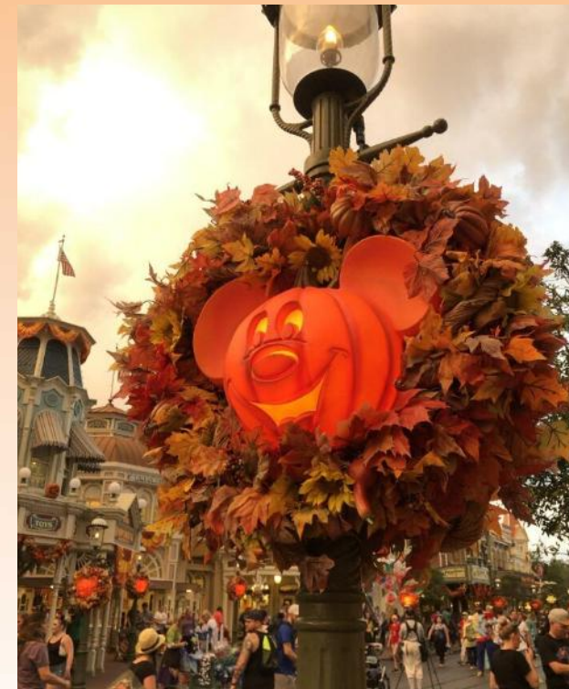
Decorations at Mickey's Not So Scary Halloween Party bring lots of fall festivity.

Other ways to celebrate Halloween include having a bonfire, baking Halloween themed foods, carving Pumpkins, and doing different Halloween crafts. However you decide to celebrate, Halloween is a holiday with different meanings to everyone. Some people think of Halloween as an opportunity to get candy while others love Halloween because it is scary. These amazing ways to celebrate Halloween will make your Halloween better than ever.