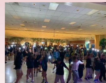
Many students loved dancing at the 6th Grade Dance.