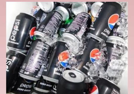
The 6th graders loved the pepsi at the dance.