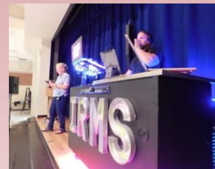
The DJ was amazing, and made the dance so much fun!!