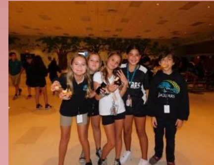
This group of girls is having a great time at the dance!