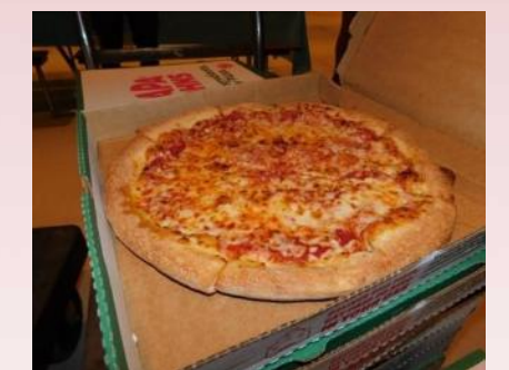
Yummy pizza was being sold at the 6th grade dance.